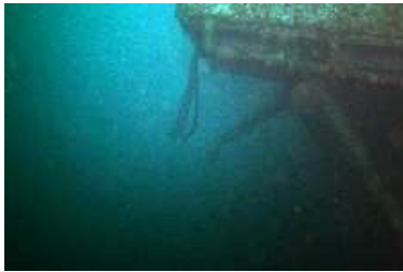
On the tower