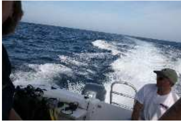
The rough ride out