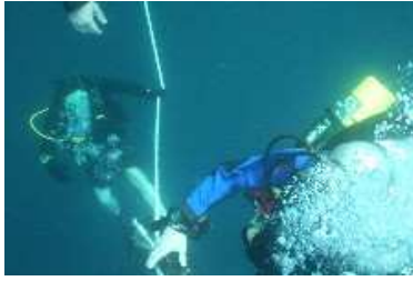
On the down line