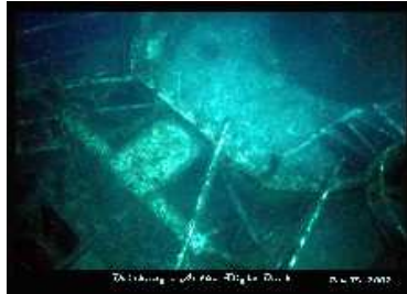
Oriskany Flight Deck