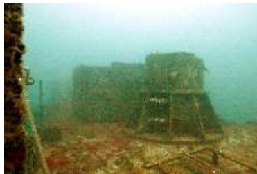
Tower, Radar mount