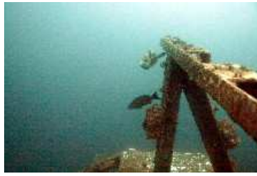
Above the Bridge