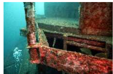
Bubbles from Bridge