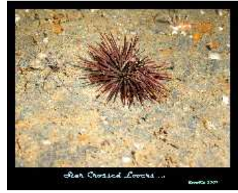
Star Crossed Lovers