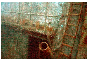
Follow the leader