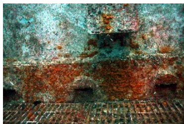
Obs Deck Crabs