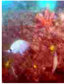
Coral on barge