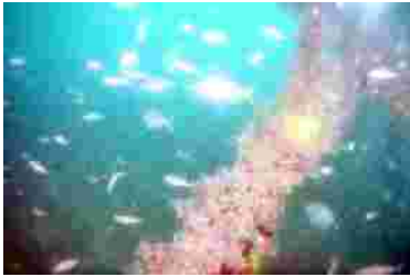
On top of the barge