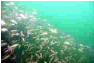
The invisible wall