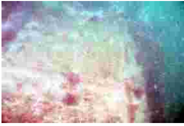
Top of APC