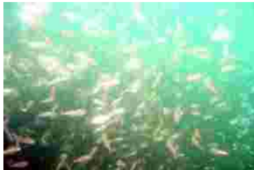
The bait school