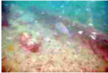
On the deck